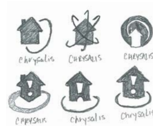
The evolution of the new logo

After a few different versions and many new ideas, we are thrilled to share the new logo with you.