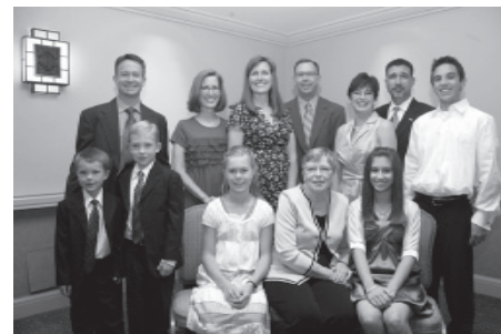
The Glawe Family and Luna Family